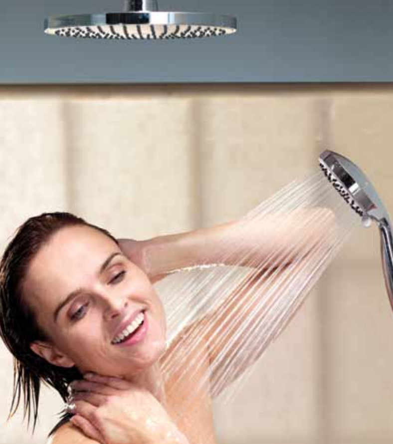
The adjustable height handset