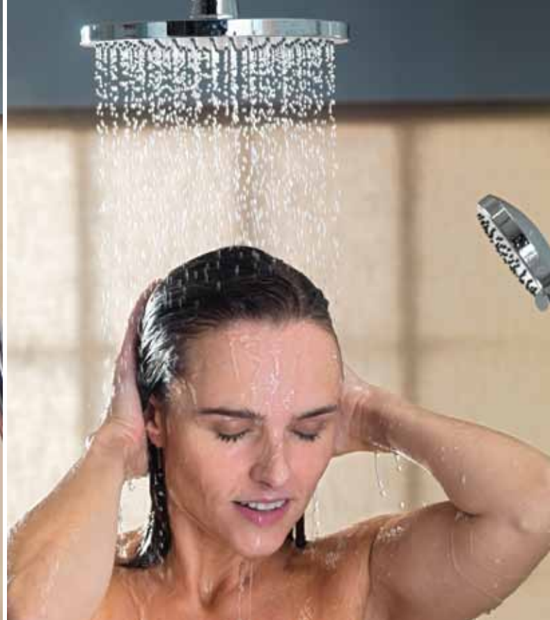
The 220mm drencher head provides a luxurious soak